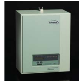
CalorVal BTU Analyzer

Use a CalorVal BTU Analyzer to measure the energy content of a waste gas, biogas or SYNGAS stream for use as an alternate fuel source in lieu of natural gas in many advanced combustion equipment, such as flare stacks, boilers, furnaces as well as Turbine Engines to help generate electricity.