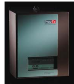
PreVEx Flammability Analyzer

Use a PreVEx in solvent-based applications to measure and control ventilation rates in process ovens, dryers and oxidizers. By recirculating the solvent, less ventilation air is used, hence less fuel is needed to heat the oxidizer to the set-point temperature. This reduces natural gas usage and will also lead to a CO 2 decrease. This may produce additional carbon credits for trading. Then, use the SNR650 FID for proper measurement and certification of the stack emissions.