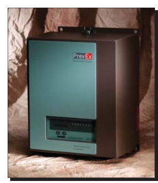
PrevEx Flammability Analyzer

All of this adds up to your plant operating at peak efficiency, which means staying safe AND productive.